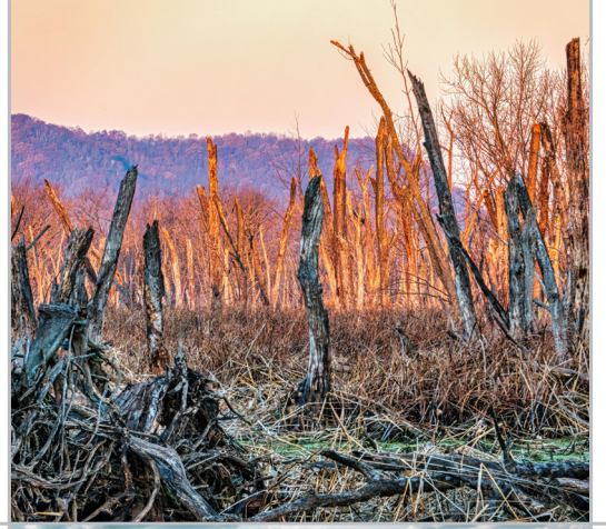
slash and burn farming